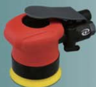
SDC-1351 3" Random Orbital Sander (Non Vacuum)