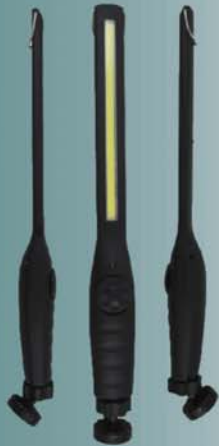
Left or Right

(with Rechargeable Lithium Battery & Magnetic)