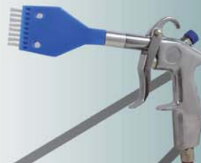
WT-0510C4 (Hard Brush, Size: Ø0.4*1cm)