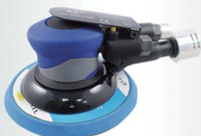
SDC-3570 & SDC-3670 (Aluminum Body) 5" & 6" Random Orbital Sander (CENTRAL-VACUUM)