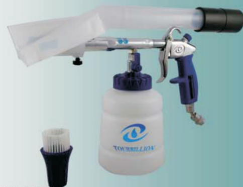
TB-2016ABS(PP)-BR Multi-Fuction Blow Suction Gun Set with Rubber Grip ( Big Size)