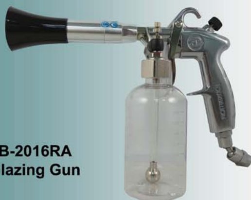
TB-2016RA Glazing Gun