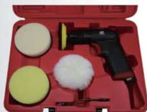
SDC-4332K 3" Air Composite Polisher Kit