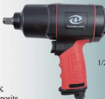
IWA-4435 1/2" Super Duty Composite Impact Wrench