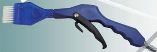
WT-0510LB4 (Soft Brush, Size: Ø0.4*2cm)