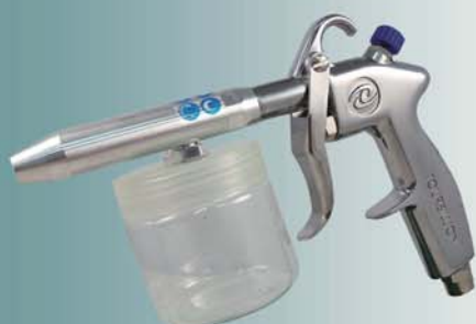
WT-0501 Dry Flake Gun