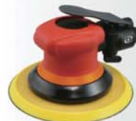
SDC-2553 & SDC-2653 SDC-1552 & SDC-1652 5" & 6" Random Orbital Sander (Non Vacuum)