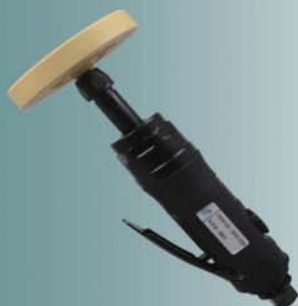
ADG-3202 Low Speed Low Noise Die Grinder