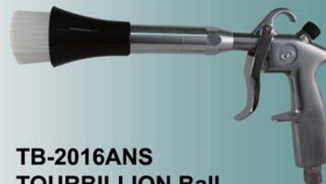
TB-2016ANS TOURBILLION Ball Mini Blow Gun with Brush