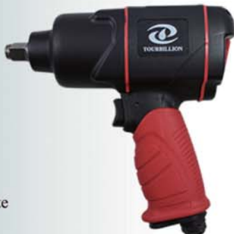
IWA-4436 1/2" Super Duty Composite Impact Wrench