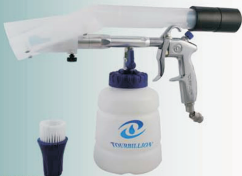
TB-2016ABS(PP) Multi-Fuction Blow Suction Gun Set ( Big Size)