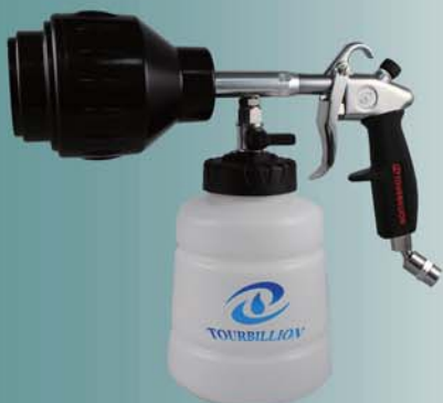
WT-0300-BR Foam Gun with Rubber Grip