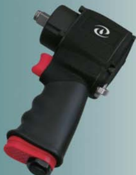
IWA-5233 1/2" & 3/8" Micro Mini Light Weight Impact Wrench