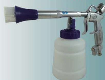
TB-2016RE1 Ball Cleaning Gun with Brush & Electronic Barometer + Adjustable Air Flow Swivel Connector