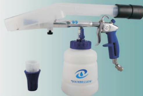
TB-2016ABSS(PP)-BR Multi-Fuction Blow Suction Gun Set with Rubber Grip (Small Size)