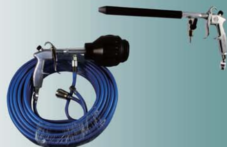
WT-0300DT 2 in 1 Foam Gun with Tube & Double Hose