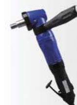
SDC-4920 & SDC-4921 7" Angle Sander