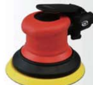
SDC-5550 5" Random Orbital Polisher