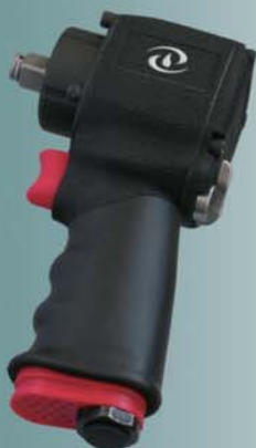
IWA-5234 & 5234A 1/2" & 3/8" Micro Mini Light Weight Impact Wrench