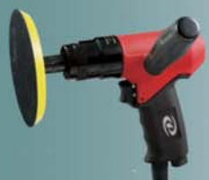
SDC-5580 & SDC-5580A 5" Angle Polisher