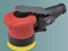
SDC-1370 3" Random Orbital Sander (Self-Generated Vacuum)