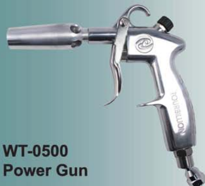
WT-0500 Power Gun