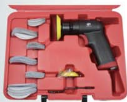
SDC-1331K 3" Air Composite Random Orbital Sander Kit