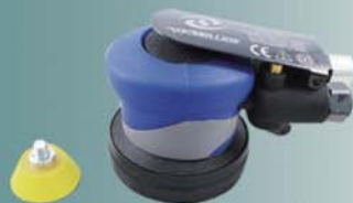
SDC-2150 (Aluminum Body) 1-1/2" Random Orbital Sander