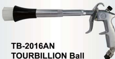
TB-2016AN TOURBILLION Ball Blow Gun with Brush