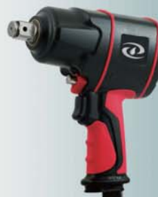
IWA-6631 3/4" Super Duty Composite Impact Wrench