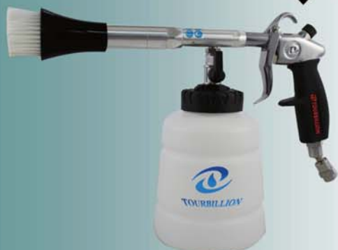
TB-2016A-BR TOURBILLION Ball Cleaning Gun with Rubber Grip & Brush