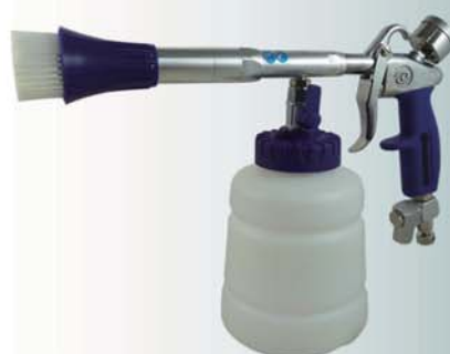
TB-2016RE1-BR Ball Cleaning Gun with Brush & Electronic Barometer + Adjustable Air Flow Swivel Connector + Rubber Grip