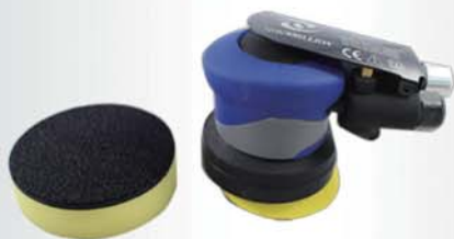
SDC-8360 (Aluminum Body) 3" Random Orbital Sander