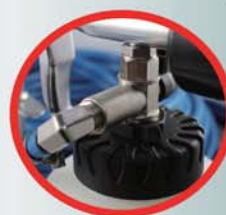
WT-0300DT2 2 in 1 Foam Gun with Tube & Double Hose