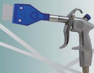
WT-0510B4 (Hard Brush, Size: Ø0.4*2cm)