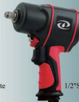
IWA-4632 1/2" Super Duty Composite Impact Wrench