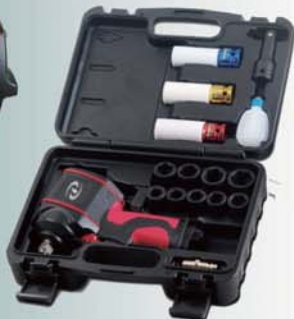
IWA-5630K 14PCS 1/2" Composite Impact Wrench Kit