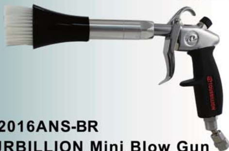
TB-2016ANS-BR TOURBILLION Mini Blow Gun with Rubber Grip & Brush