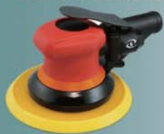
SDC-2572 & SDC-2671 SDC-1571 & SDC-1671 5" & 6" Random Orbital Sander (Self-Generated Vacuum)