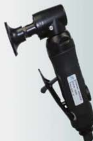
SDC-4230 3" Sander W/ Disc Pad & Sanding Pad