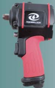
IWA-5432 1/2" Super Duty Composite Impact Wrench