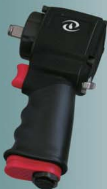
IWA-5235 & 5235A 1/2" & 3/8" Micro Mini Light Weight Impact Wrench