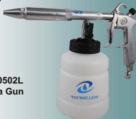
WT-0502L Soda Gun