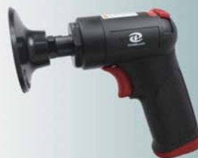
SDC-4331 3" Sander W/ Disc Pad & Sanding Pad