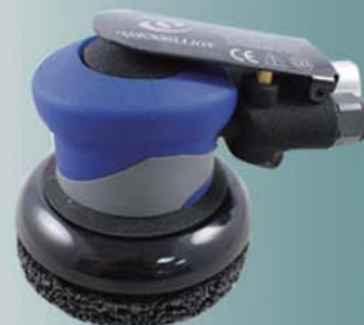
SDC-4450 (Aluminum Body) 4" Rotary motion abrasive Tool