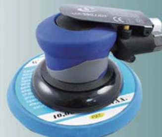
SDC-3561 & SDC-3660 (Aluminum Body) 5" & 6" Random Orbital Sander (SELF-VACUUM)