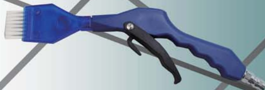
WT-0510LA2 (Soft Brush, Size: Ø0.2*2cm)