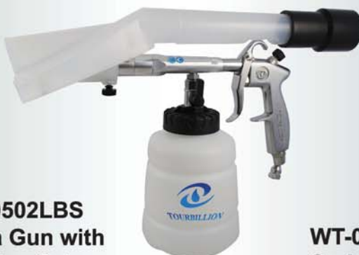
WT-0502LBS Soda Gun with Suction Set (Big Size)