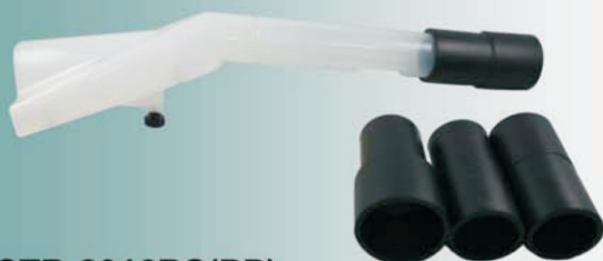
ACTB-2016BS(PP) Dust Collecting Cover Set (Big Size)