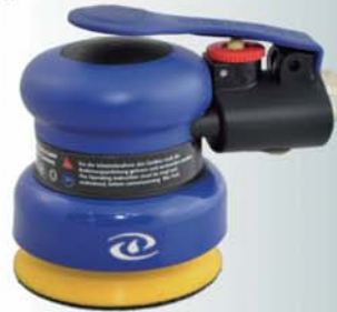
SDC-4530 3" Light Weight Lower speed Palm Sander