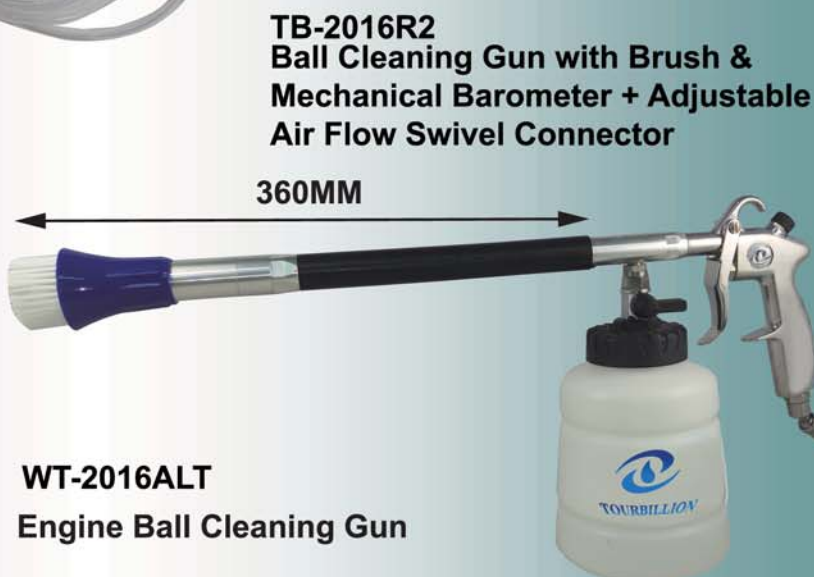
WT-2016ALT Engine Ball Cleaning Gun