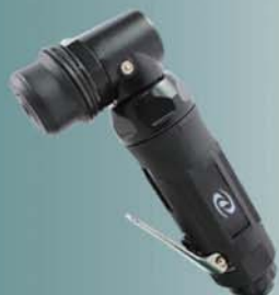
SDC-1220 2" Spot Repair Sander