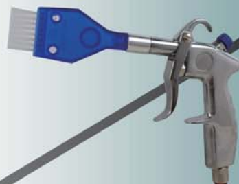
WT-0510A2 (Soft Brush, Size: Ø0.2*2cm)