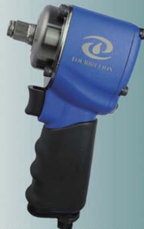
IWA-5237 & IWA-5237A 1/2" & 3/8" Mini Impact Wrench