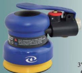
SDC-1530 3" Palm Random Orbital Sander