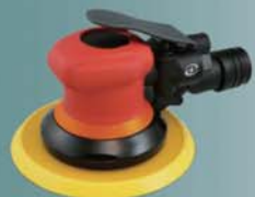
SDC-2562 & SDC-2661 SDC-1561 & SDC-1661 5" & 6" Random Orbital Sander (Central Vacuum)