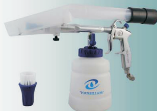
TB-2016ABSS(PP) Multi-Fuction Blow Suction Gun Set (Small Size)