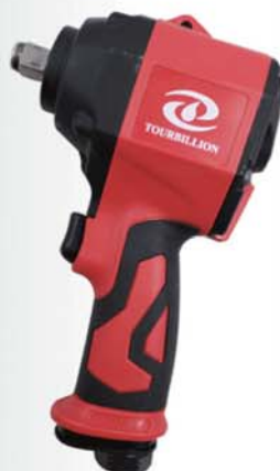
IWA-5430 Composite Mini Impact Wrench