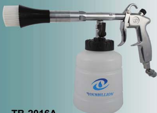
TB-2016A TOURBILLION Ball Cleaning Gun with Brush