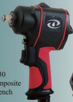
IWA-5630 1/2" Mini Composite Impact Wrench