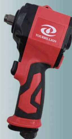
IWA-5431 Composite Mini Impact Wrench