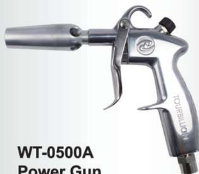
WT-0500A Power Gun