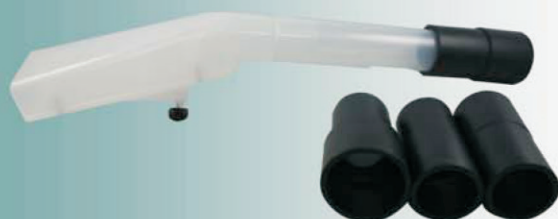
ACTB-2016BSS(PP) Dust Collecting Cover Set (Small Size)