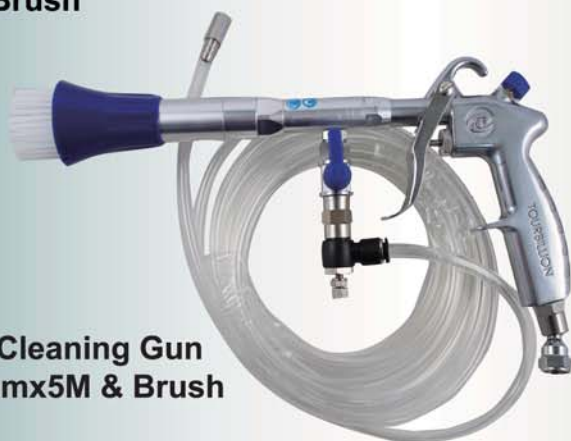
TB-2016AD1 TOURBILLION Ball Cleaning Gun with Hose 8mmx5mmx5M & Brush