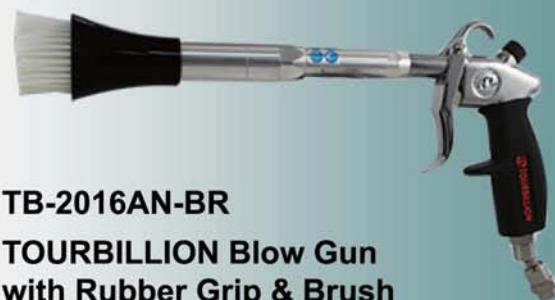
TB-2016AN-BR TOURBILLION Blow Gun with Rubber Grip & Brush