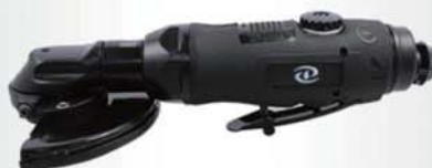
ADG-2400A 4" Reversible Air Axial Cutter