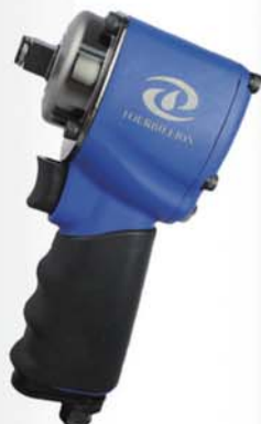
IWA-5236 & IWA-5236A 1/2" & 3/8" Mini Impact Wrench