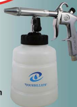
WT-0502 Soda Gun