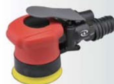
SDC-1360 3" Random Orbital Sander (Central Vacuum)