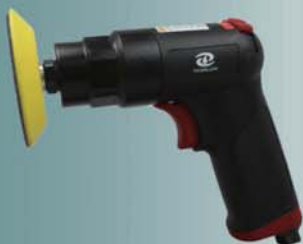
SDC-4322 3" Air Composite Polisher