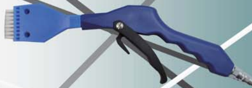
WT-0510LC4 (Soft Brush, Size: Ø0.2*1cm)