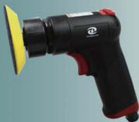
SDC-1331 3" Air Composite Random Orbital Sander