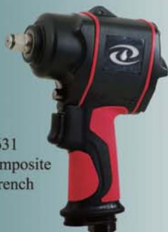
IWA-5631 1/2" Mini Composite Impact Wrench