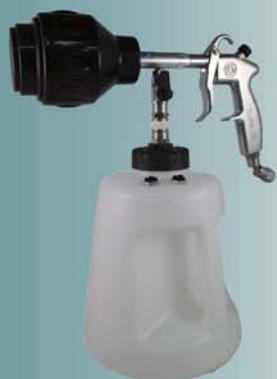
WT-0300(3L) Foam Gun