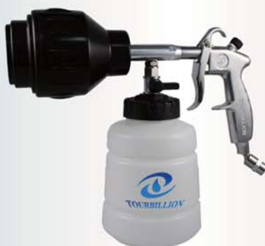
WT-0300 Foam Gun