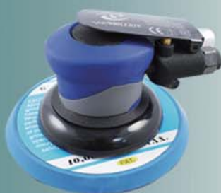
SDC-3551 & SDC-3651 (Aluminum Body) 5" & 6" Random Orbital Sander (NO-VACUUM)