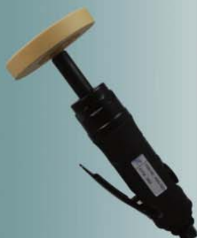
ADG-3203 Low Speed / Low Noise Air Eraser