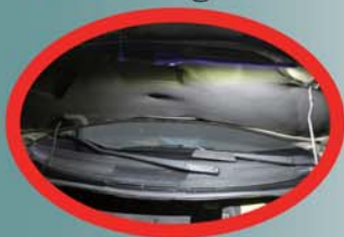
Engine room lighting

LWL-9880WY, Two-color 10 W COB light board, one color - white, Another color - yellow light. Used in the vehicle surface fine lines of irradiation, to determine whether the surface polishing is flat / bright.