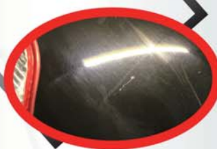
vehicle surface fine lines of irradiation by LWL-9880WY