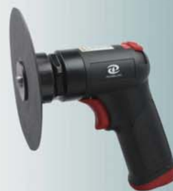
SDC-4531 5" High Speed Sander