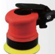
SDC-5350 3" Random Orbital Polisher