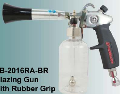
TB-2016RA-BR Glazing Gun with Rubber Grip