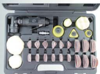
SDC-1220K 2" Spot Repair Sander Kit